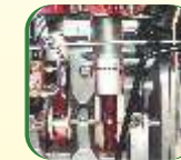
Oil Jet for Piston Cooling