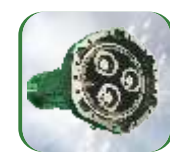
Planetary Gear with Straight Axle