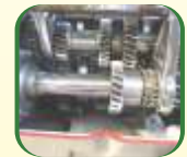
Top Shaft Lubrication