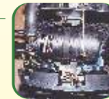
Dry Type Air Filter