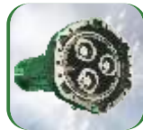
Planetary Gear with Straight Axle