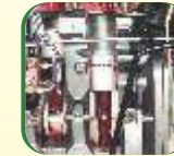
Oil Jet for Piston Cooling