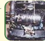
Dry Type Air Filter