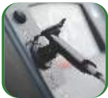
Mobile Charging Point with Holder