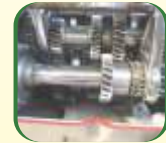
Top Shaft Lubrication