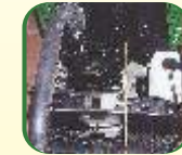
Radiator with Overflow Reservoir