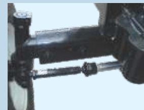
Heavy Duty Front Axle (2WD)/ Power Steering