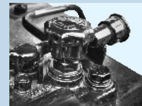
Use to lift the trolley without lifting of hydraulic lift.