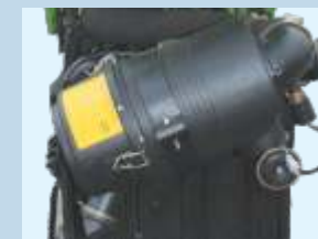
Dry Air Cleaner