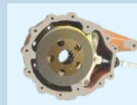
Oil immersed Brakes for better braking due to larger braking area & longer life due to oil cooling.