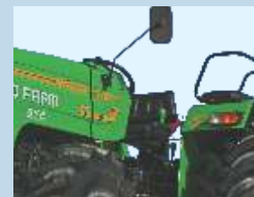
Constant Mesh Gear Box with Side shift gear levers for easy gear shifting & more leg space.