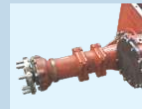
Straight Rear Axle, Less maintenance and repair