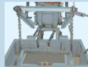
Heavy 1800 kgs Lift, suitable for heavy implements and tipping trailers with higher loads