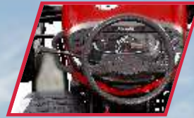
12+12 SOLIS SHUTTLE SHIFT