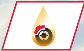
MULTI DISC OUTBOARD OIB