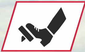
DUAL CLUTCH / *DOUBLE CLUTCH