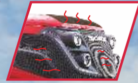
6 STAGE COOLING